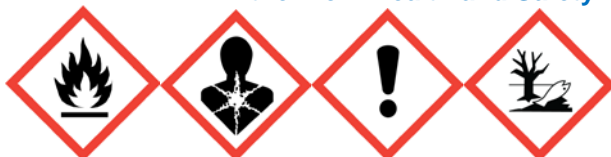
Flame Health Hazard Irritant Aquatic Hazard

Conforms to Regulation (EC) No 1272/2008 and aligns to the United Nations Globally Harmonized System Conforms to the Australian Preparation of Safety Data Sheets for Hazardous Chemicals under section 274 of the Work Health and Safety Act